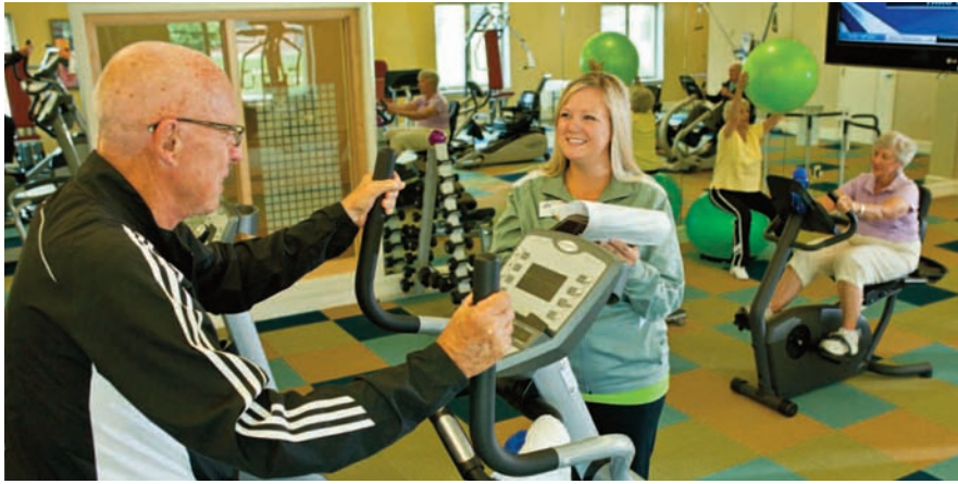
Residents utilize the fitness center daily at Marquette Athletic Center.